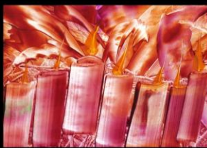
Encaustics by: Stuart Allen

OPENING RECEPTION: SUNDAY, NOVEMBER 20 1:00 - 4:30PM