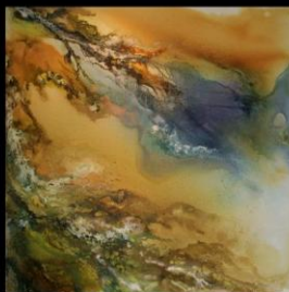
Paintings by: Lynn Colpitts