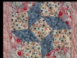
Quilts by: Darlene Friesen

106 - 1320 Kingsway Ave. Port Coquitlam BC Located on Corner of Mary Hill Bypass & Kingsway