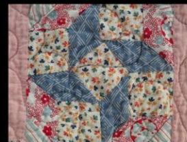
Quilts by: Darlene Friesen

106 - 1320 Kingsway Ave. Port Coquitlam BC Located on Corner of Mary Hill Bypass & Kingsway