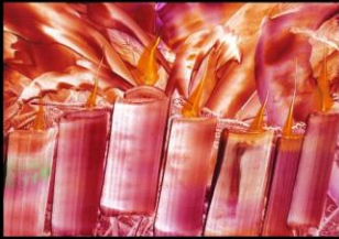
Encaustics by: Stuart Allen

OPENING RECEPTION: SUNDAY, NOVEMBER 20 1:00 - 4:30PM